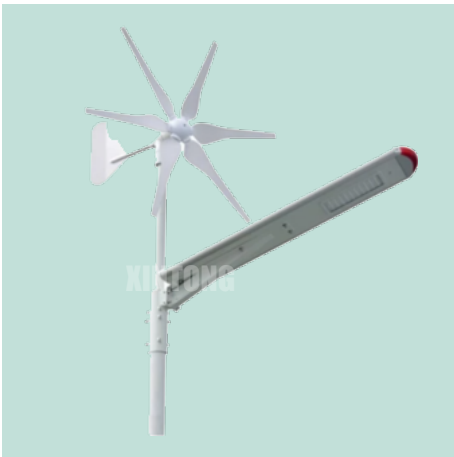
Solar Wind Street Light