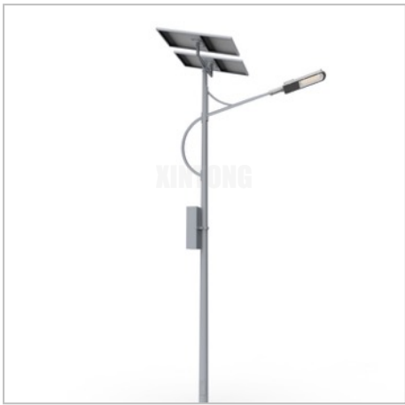
Battery Hanged Middle