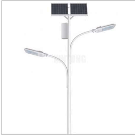
Battery Hanged Top