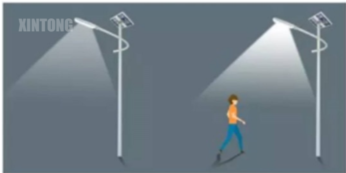
Human Body Control