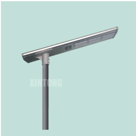
Integrated Solar Street Light