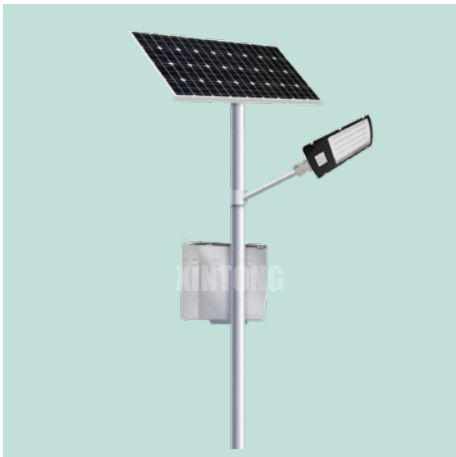
Traditional Solar Street Light