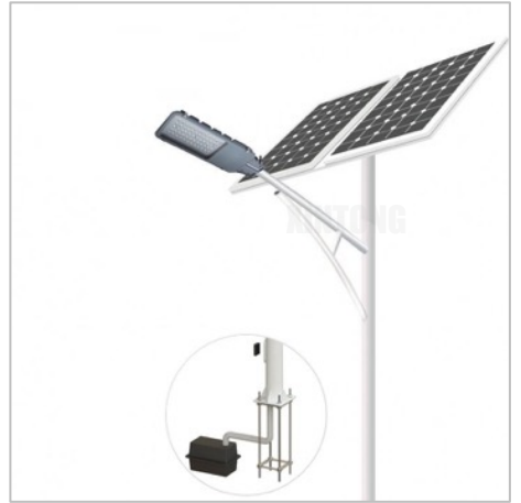
Battery Buried Underground